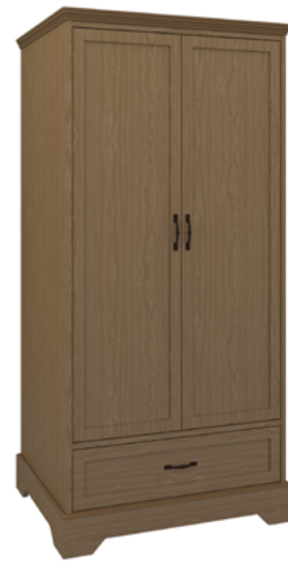
Model: DOWR12 34.5W 23.75D 71H

Stately Dorchester combines traditional detailing with modern architectural lines, while providing plenty of storage. Suit your style by choosing from a variety of hardware options and make an impeccable impression in any resident or patient room. Raised cabinetry promises ease of cleaning below case goods.